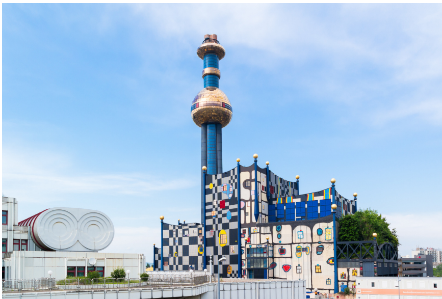
SPITTELAU EFW PLANT (VIENNA) - SUCCESSFULLY OPERATING SINCE 1971