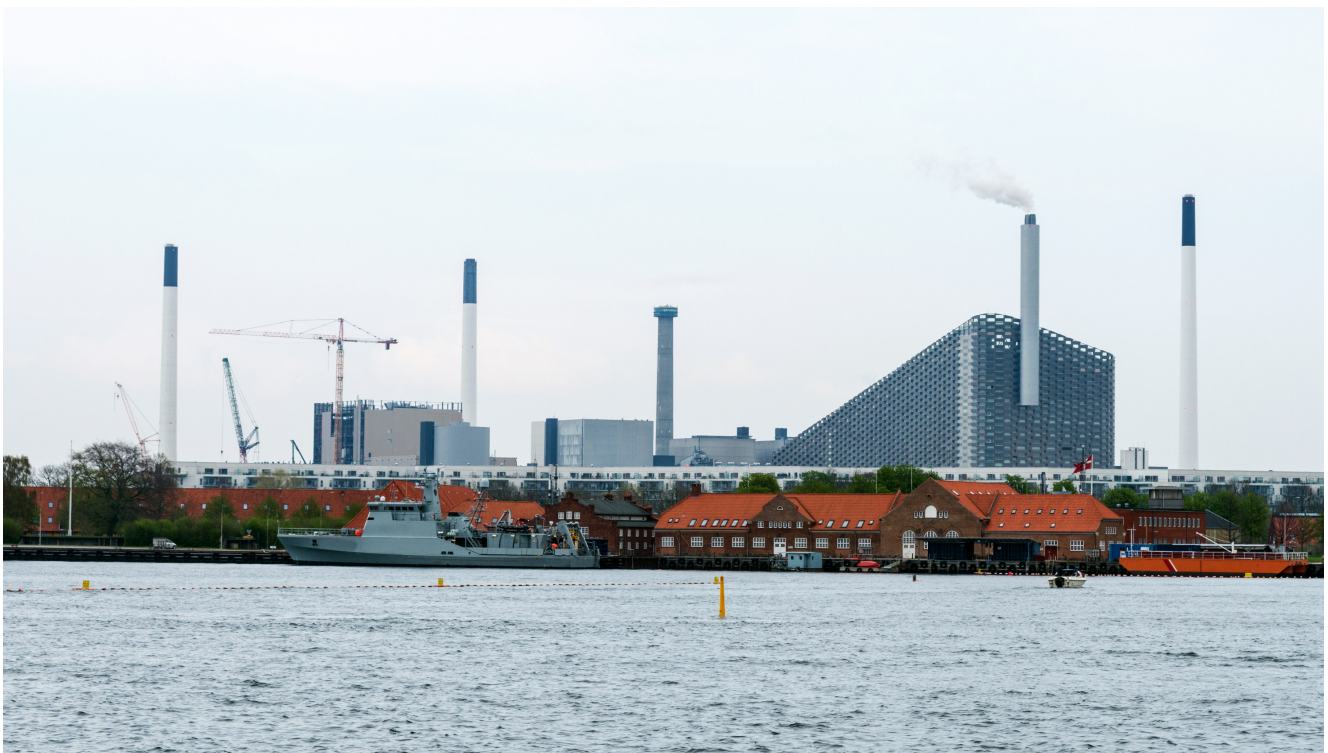
AMAGER BAKKE EFW PLANT IN COPENHAGEN, OPENED IN 2017.

With the cost of landfill increasing as well as some major Australian cities running out of landfill space, EfW can assist in managing these materials. Processing non-recyclable wastes for energy recovery rather than sending them to landfill also increases the lifespan of existing landfills.